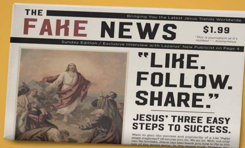
The Fake News Series : Like, Follow, Share

FOLLOW HOLY CROSS LIFE TEEN ON SOCIAL MEDIA!