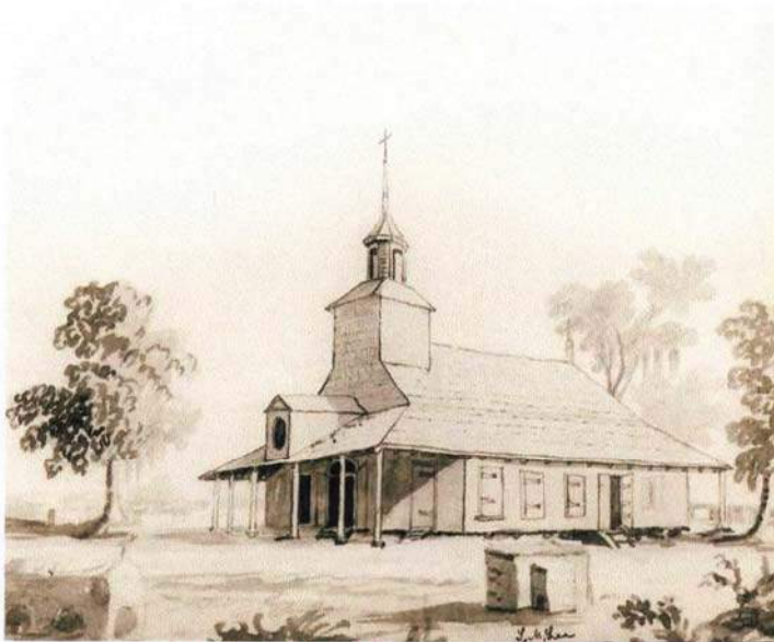
Saint Martin de Tours Church, early 1800's sketch

In 1803, Louisiana became part of the United States of America through the Louisiana Purchase. For the first time, the Catholic Church in Louisiana was not officially supported by the state. France and Spain were able to send missionary priests to the New World and paid for priests salaries as well as other financial needs. While the United States allowed freedom of religion through the First Amendment to the Constitution, it did not permit the state to support any faith. With a lack of priests and