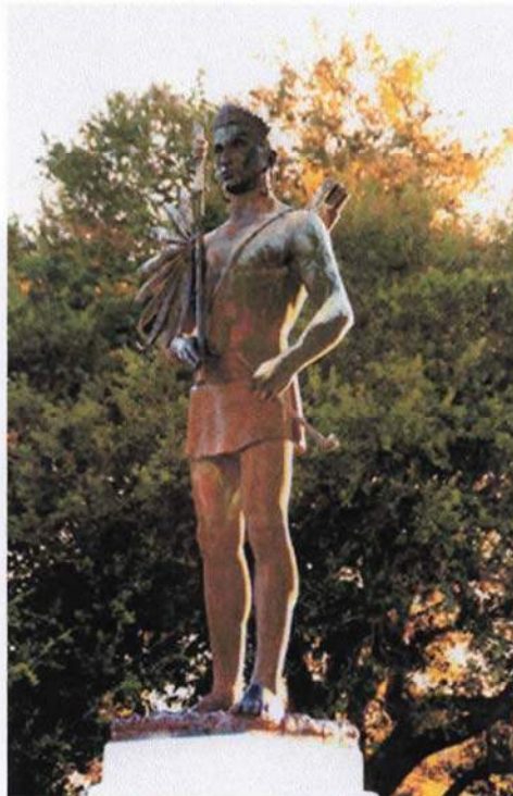
Status of Attakapas Indian, St. Martinville

The Attakapas were one of four major native tribes that inhabited the vast lands between the Atchafalaya River and the Sabine River. Though the territory had been claimed for France in 1699 as part of Louisiana, it was not until the 1740s that the first European settlers lived in the area. They formed small settlements named Opelousas and Attakapas (later St. Martinville).