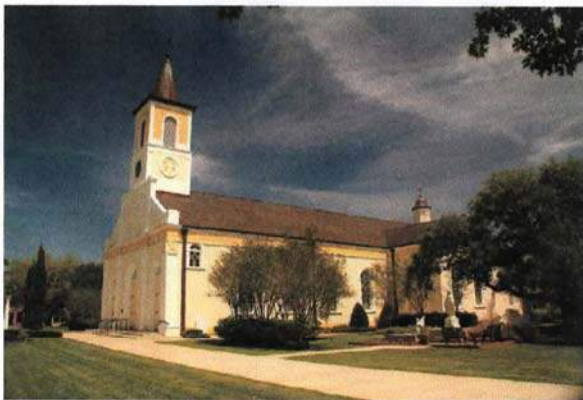
Saint Martin de Tours Church today, St. Martinville

In 1814, there were 12 priests serving the entire Louisiana territory. Many parishes were without a pastor. At this time the pastor of St. Landry in Opelousas was also overseeing the churches in Avoyelles and Natchitoches. Apart