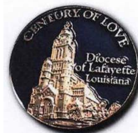
Centennial Lapel Pin

One hundred years after the creation of the first Church parish in Southwest Louisiana, thirteen parishes cared for the pastoral needs of the people and the faith continued to grow. In 1869, the first parish west of the Mermentau River was established at Lake Charles. The area, which had been overseen by the pastor of Abbeville, was now a parish with a territory of 4,000 square miles. Over 100 years later, this parish would become the Cathedral of the Diocese of Lake Charles. Despite economic difficulties, the decades following the Civil War were a period of great growth with 31 new parishes erected in Southwest Louisiana. The 1880s saw a new wave of